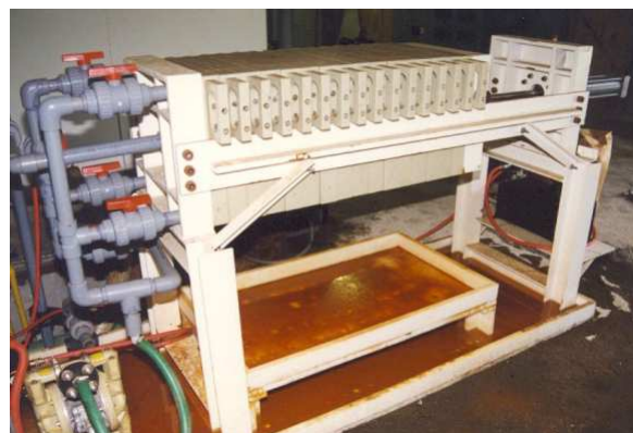
Figure 2. Filter Press for treatment of the waste liquids

The Filter Press (Figure 2) is used to remove the liquids from the sludge. The resulting press-cake (processed by the filtering diaphragms) appears as a semi-dry material (with about 30% solids and no free liquid), and is discharged as a solid material (i.e. solids), separately from the treated liquids.