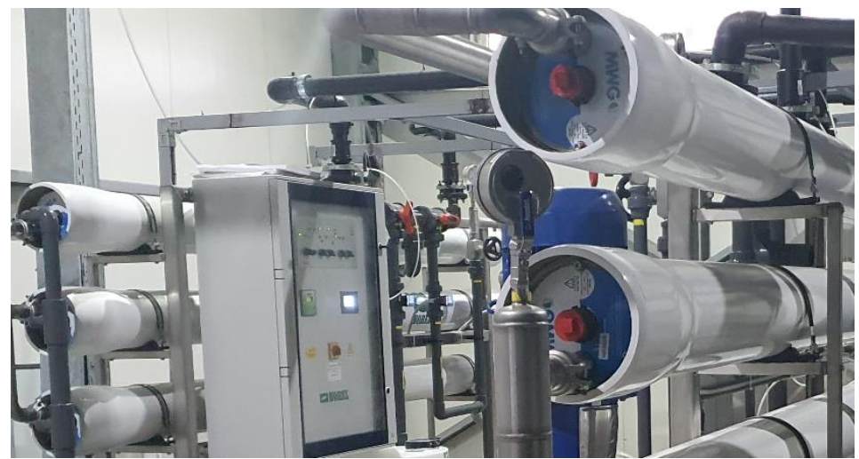
Fig. 1. Specialised Technological Component for Processing and Recirculation of Softened Water Required in the Research of Aluminium Alloy Plates Quenching Process

The demineralized water used in the experiments was provided by a Specialised Technological Component for Processing and Recirculation of Softened Water Required in the Research of Aluminium Alloy Plates Quenching Process (Figure 1).