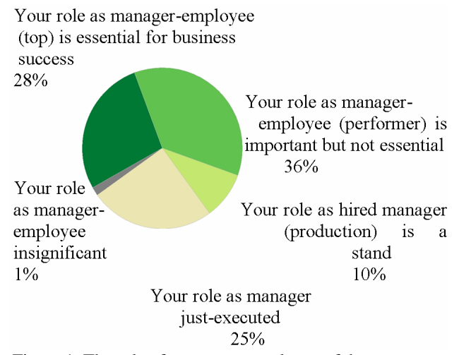
Figure 1. The role of manager - employee of the company

The survey results indicate a nearly uniform group of managers in three categories according to their perception of importance: