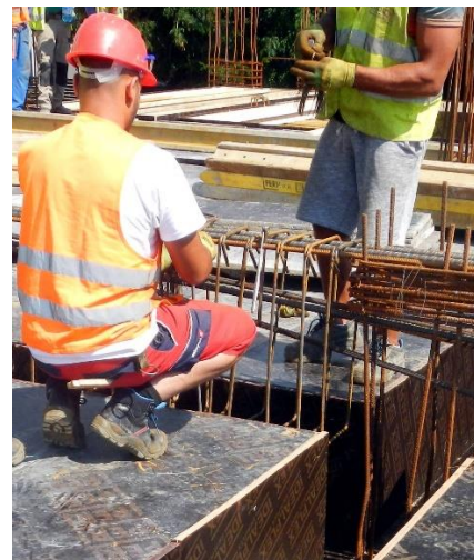
d. Armature binding Observed postures: squatting, sitting on tiptoes