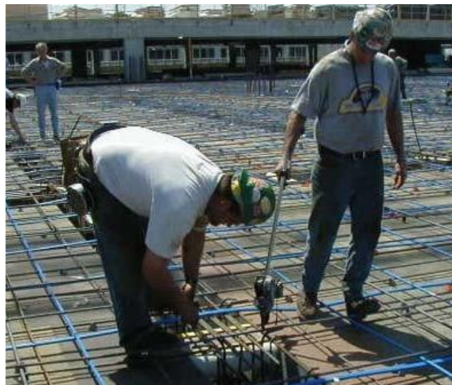
Fig. 4. Illustration of an 'easy' solution. Notice the difference in posture when the iron bars are tied manually and when they are tied using a machine [8]

According to this assessment, measures that prevent ergonomic risks are chosen. However, the technical measures and the measures regarding the workers' exposure to these risks are the most efficient and should be implemented first. The implemented measured ought to optimize the interactions between employees, work tasks, work equipment and work environment in order to improve safety, performance and usability (effectiveness, efficiency and satisfaction) [9].