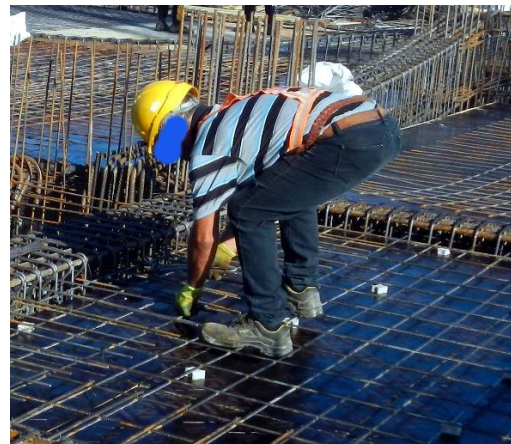
b. Armature binding Observed postures: bent forwards, squat