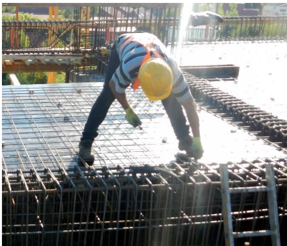
c. Armature binding Observed postures: bent forwards at over 90° Duration of holding the posture: 1 – 6 min. Frequency: 5-15 times/hour