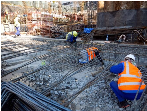
a. Placing concrete iron bars on site Observed postures: squat, on knees

For instance, for reinforcing a floor with concrete iron bars (Figure 1), the worker must carry them close to where they will be mounted, put them in place and then tie them together with wires.