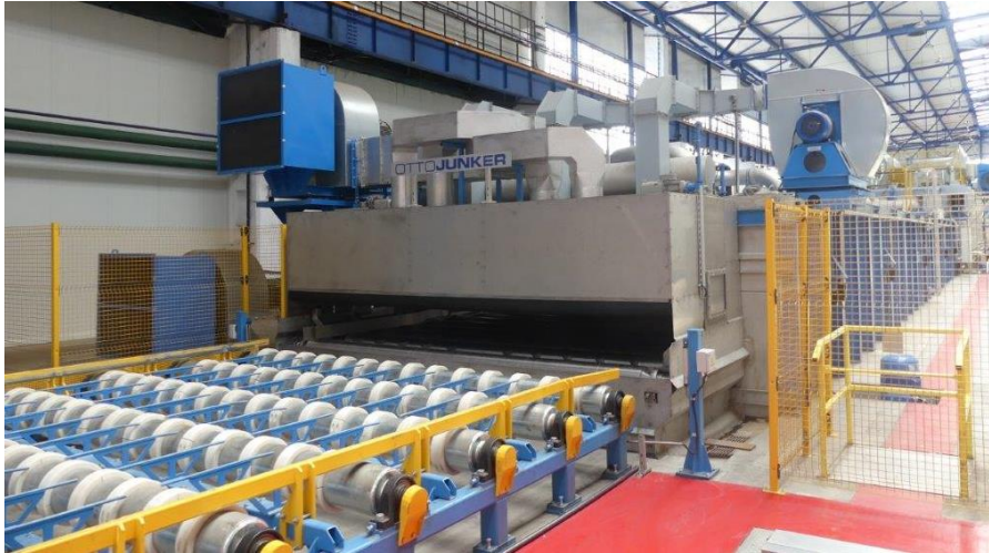
Fig. 1. The independent equipment for the research of aluminium alloy quenching process

The industrial tests were performed on 6061 aluminium alloy plates. The aluminium alloy plates were obtained by hot rolling from a cast slab.